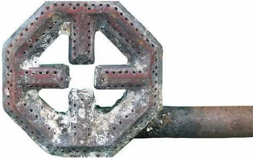
Gas Buner Cleaner