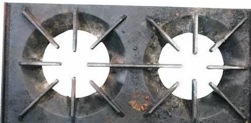
Stove Parts Cleaner