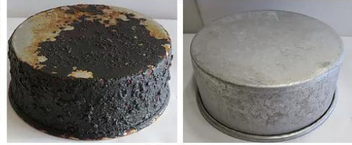
Gas Buner Cleaner